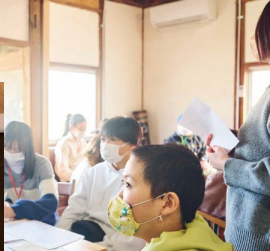
KIKKAKE PLACE (Shimogion-cho, Hyogo Ward)

In recent years, shuttered stores have become conspicuous in the Hirano shopping district. The kitchen and counters were renovated, and this space has been turned into a place where people who want to open a store or start a business can trial their business. Currently, a variety of stores including a diner and cafes are running shops in this space.